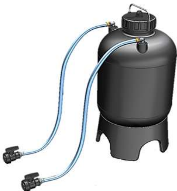
Plastic Fertilizer Tank ( 60 Ltr )